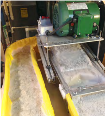
The Oracle beater making pulp from repurposed cloth